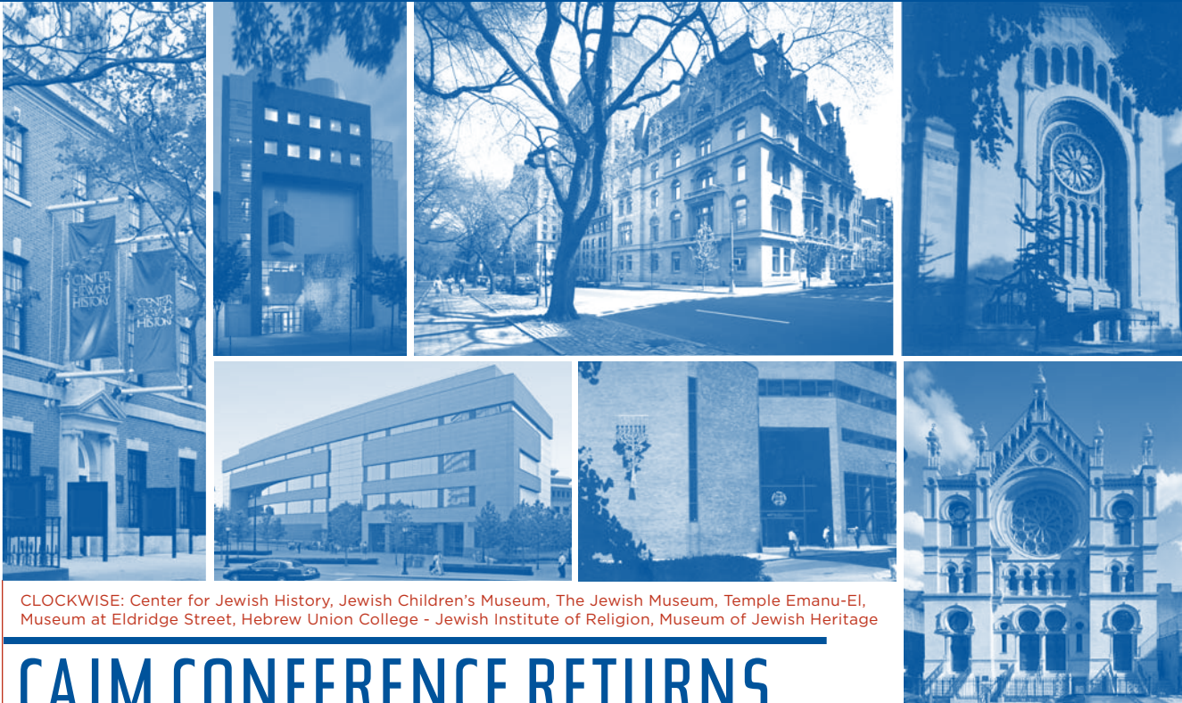
CLOCKWISE: Center for Jewish History, Jewish Children's Museum, The Jewish Museum, Temple Emanu-El, Museum at Eldridge Street, Hebrew Union College - Jewish Institute of Religion, Museum of Jewish Heritage

Affiliated with the Foundation for Jewish Culture