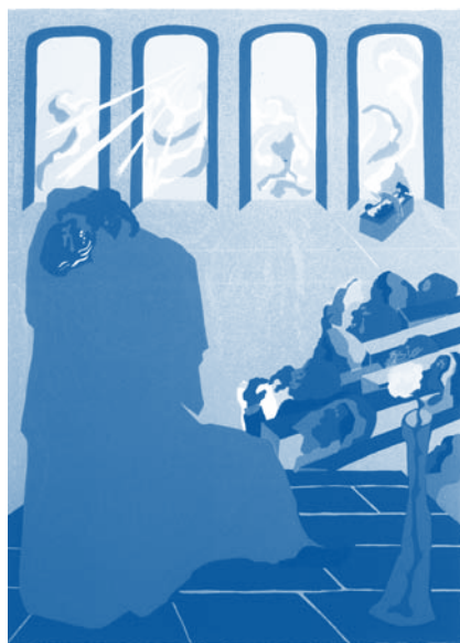
And God brought forth the firmament and the waters from Eight Studies for the Book of Genesis. Jacob Lawrence. 1989-1990, silk-screen print on paper. In the Beginning: Artists Respond to Genesis. Contemporary Jewish Museum, CA.