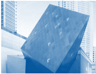
Contemporary Jewish Museum, San Francisco.

Following in rapid succession the major openings last winter of the Museum at Eldridge Street in New York City and the Spertus Institute of Jewish Studies in Chicago, the Contemporary Jewish Museum in San Francisco and the Jewish Museum Milwaukee opened this spring.