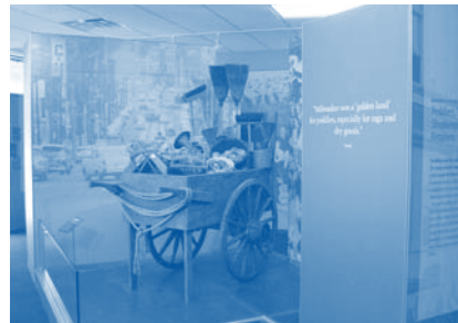
A peddler's cart illustrates how many early Jewish immigrants to Milwaukee earned a living.