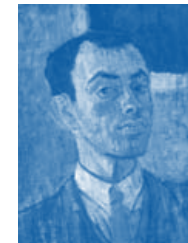
Self Portrait in Red Tie, 1914. Isaac Rosenberg. Oil on canvas. Private collection. Whitechapel at War: Isaac Rosenberg and His Circle. Ben Uri Gallery, UK.